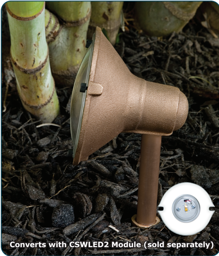
Converts with CSWLED2 Module (sold separately)